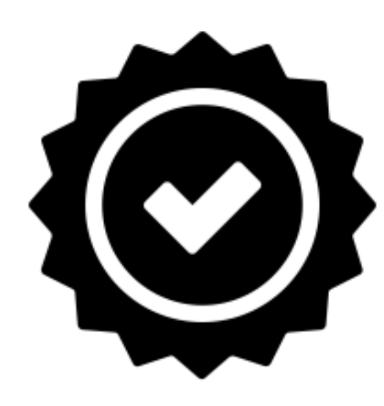
10 years warranty on parts and compressors